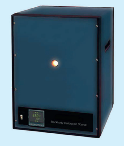
Fig 1: Commercially available blackbody calibrator

A specially designed insertion thermocouple can be temporarily mounted in place of the pyrometer's lens assembly. Using a sliding gland seal fixture, a stainless steel sheathed thermocouple is inserted into the pyrometer nozzle to the closed block valve. The sealing gland is then tightened to minimise leakage but permits the thermocouple to be inserted to a pre-determined distance to measure the temperature just beyond the refractory hot face (see Fig. 2). This method