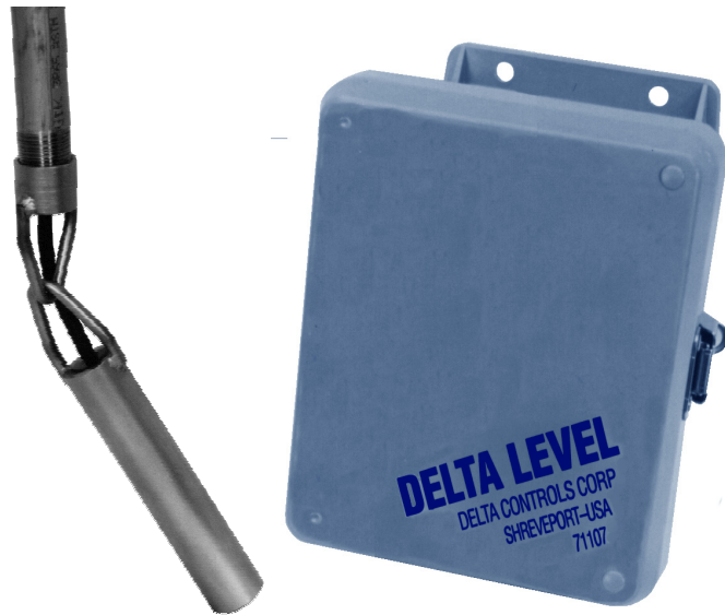
Model 835 With Model 60 Probe

The interconnecting cable is very flexible. Each wire has rubber insulation. The overall jacket is abrasion resistant rubber.