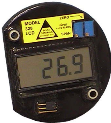
328 DISPLAY MODULE ONLY

The Model 328 display is a potted plug-in module for rough services and will withstand some corrosive environments. The Model 328 is a 4-20mA loop powered 3-1/2 digit LCD display. The display has voltage spike protection and is supplied precalibrated at 0-100%, but can be field calibrated to engineering units from 4 mA = 0-200, minimum to 20 mA = 200-1999 maximum. The position in which the decimal point is displayed is chosen by a jumper setting on the front of the display body.