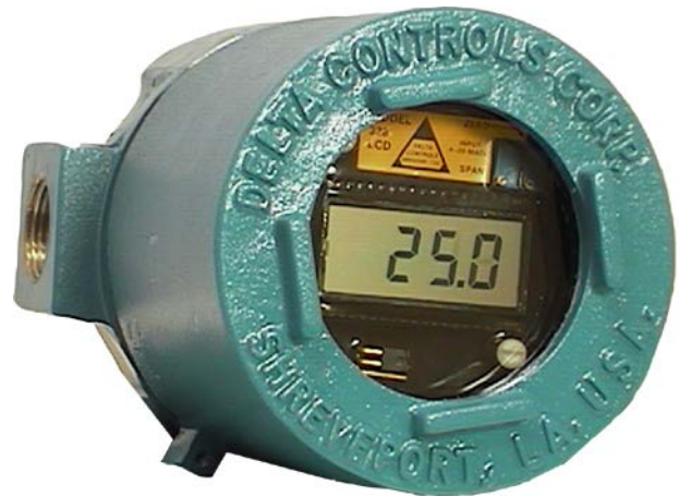
328 DISPLAY MOUNTED IN AN X-P HOUSING