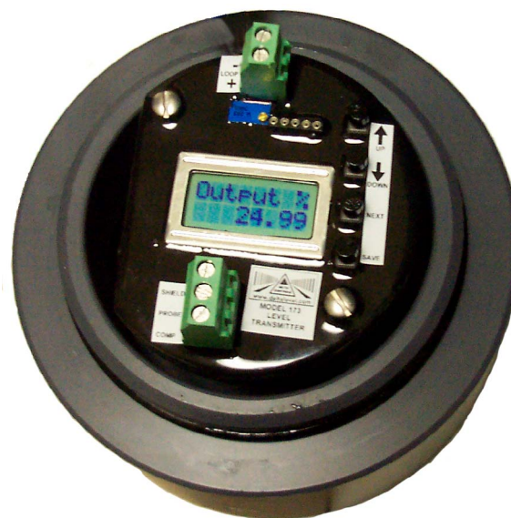
Mounted in a 4X PVC Housing with Cover Removed