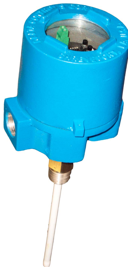
Mounted in an explosion-Proof Housing

It will correctly transmit the position of an interface by sensing the ratio of the admittance of the two liquids. Typical interfaces include oil/water, gasoline/acid, and foam/effluent. Interface control is important in crude oil separation, flotation mining, seed oil milling, and fuel tank sediment monitoring. The interface can be accurately detected even though it may be "cloudy" or be carrying a "rag layer."